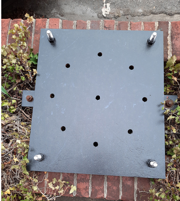
Plate is 21" x 24" with the short side facing the street. All 9 holes are 3/4" in diameter.